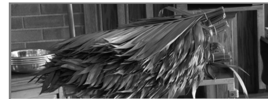
Palm Sunday 2017